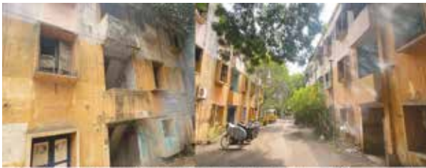
Old building of Tamil Nadu Urban Habitat Development in Rajathottam Scheme area