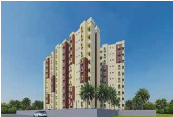
New building to be constructed by the Tamil Nadu Urban Habitat Development in Rajathottam Scheme area

The Hon'ble Chief Minister of Tamil Nadu Thiru. M.K.Stalin, on behalf of the Tamil Nadu Urban Habitat Development Board laid the foundation for 162 multi-storied flats, to be constructed at a cost of Rs. 27.03 crore, at the Rajathottam Scheme area under the Kolathur Assembly Constituency, on 12.09.2023.