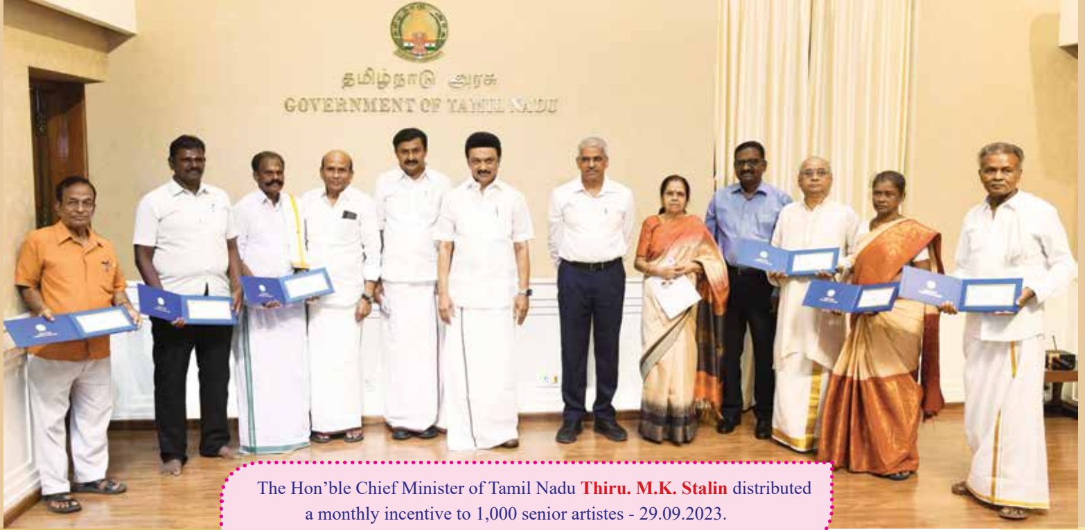
The Hon'ble Chief Minister of Tamil Nadu Thiru. M.K. Stalin distributed a monthly incentive to 1,000 senior artistes - 29.09.2023.