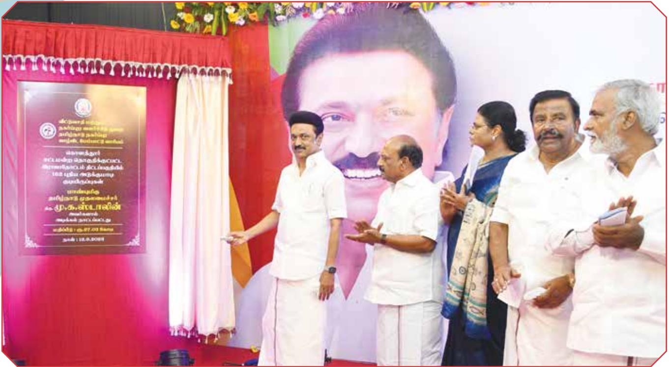
The Hon'ble Chief Minister of Tamil Nadu Thiru. M.K.Stalin laid the foundation stone for 162 multi-storied flats in the Rajathottam scheme area in Kolathur - 12.09.2023.